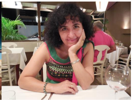
Siena, Rome, St Martin

Our annual news is on the christmas card section of our website with better photo viewing. Send us an email and we will respond. Promise.