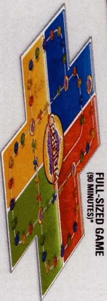
FULL-SIZED GAME (90 MINUTES)*

*This is our best guess. Actual game times may vary depending on luck, adequate and/or distracting snacks, and the overall brilliance of the players.